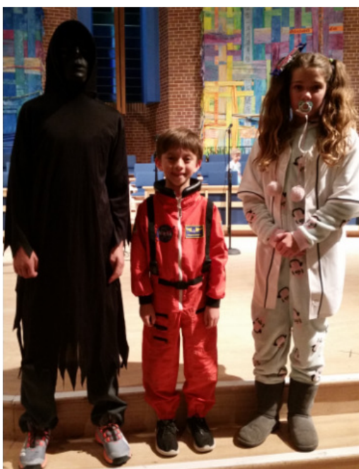
1 st Place 2 nd Place 3 rd Place