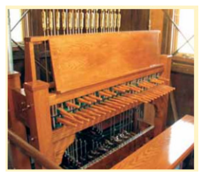
The Carillon console at Trinity Episcopal Cathedral