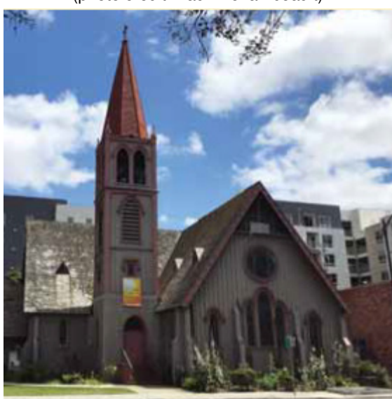
Trinity Episcopal Cathedral, San Jose, California