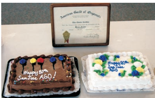
From the Oct. 19 Members' Concert.