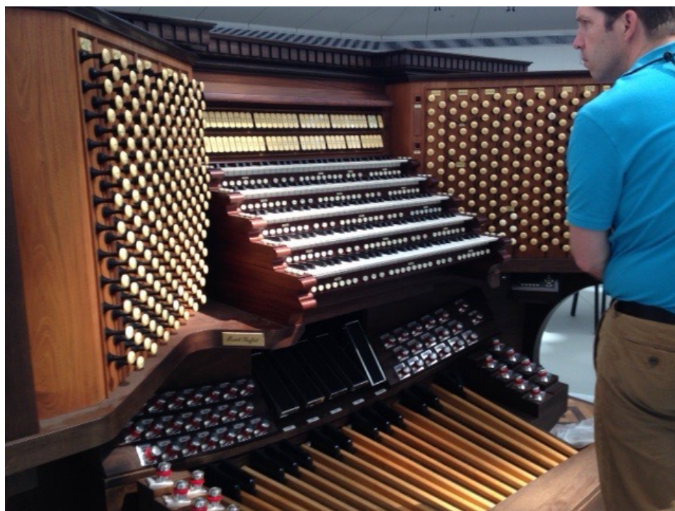
The Ruffatti console, Christ Cathedral, formerly Crystal Cathedral

Early every morning we started with a workshop, of which Jim Welch presented two. Bus rides to most venues let attendees network and chat, a well-utilized time. Our first trip was to the newly renovated Christ Cathedral (Catholic), formerly Crystal Cathedral . The Ruffatti organ restoration is not quite finished, but we heard a few pieces on part of it, via a replacement console. The main organ's 14 divisions are divided on all four sides of the cathedral. The Ruffatti console, pictured below, is super impressive, one of the largest ever built! Full concerts took place in the Arboretum with the Aeolian-Skinner organ. At lunch on the patio of the cathedral we were treated to a carillon concert.