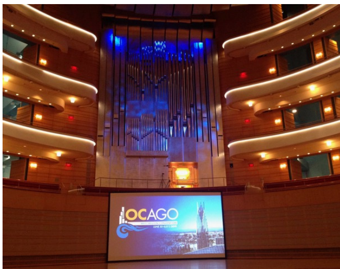
Segerstrom Concert Hall