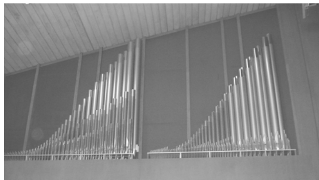
The organ at Bethel Lutheran is a fine Schantz instrument of approximately 20 ranks.