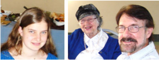
Pictures of some of the people at the Pot Luck Dinner. I did not get pictures of everyone that were there.