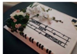
130 year Birthday Cake